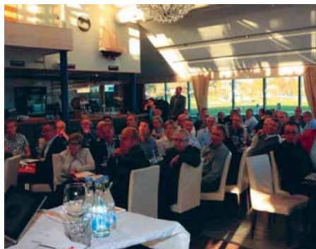
Annual General Meeting in Västerås, 24 April 2014.

The Annual General Meeting shall be held no later than four months after the end of the financial year. At the AGM, decisions are made regarding approval of the balance sheet and income statement, discharge from liability for the Board and MD and allocation of the company's retained earnings.