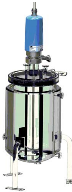
Example, AQ Dynamic Mixer mounted on a glass tank